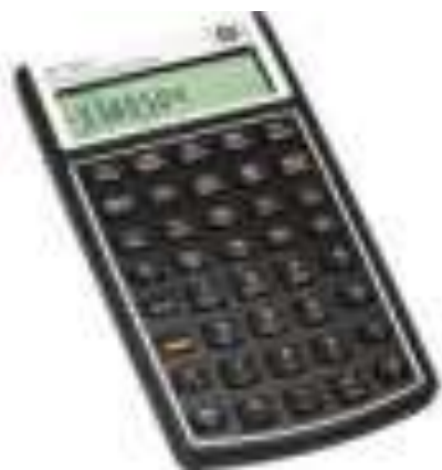
Hewlett Packard 10B II