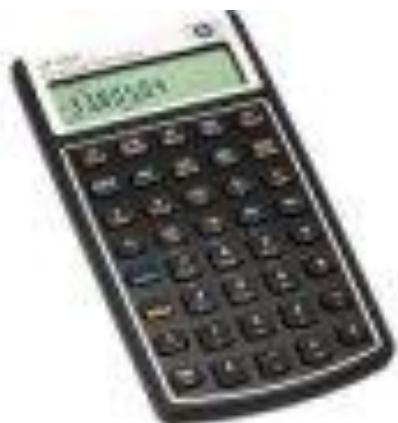
Hewlett Packard 10B II